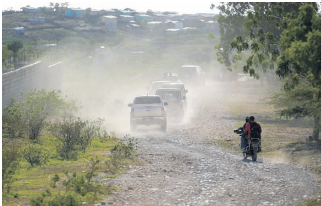
A caravan drives to the airport after departing from the Christian Aid Ministries headquarters at Titanyen, north of Port-au-Prince, Haiti, Dec. 16, 2021.